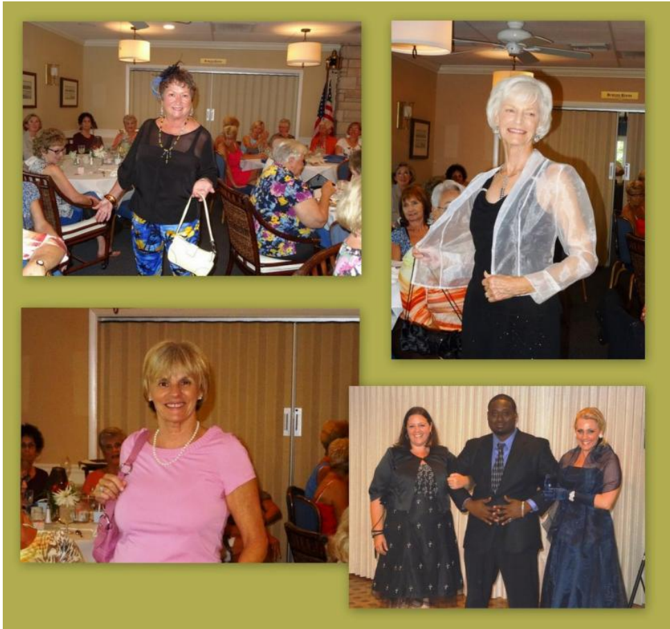
The Ladies lunch and fashion show was held at the Vero Beach Yacht Club on April 5th. Seventy four guests attended, raising $610 for VNA hospice.